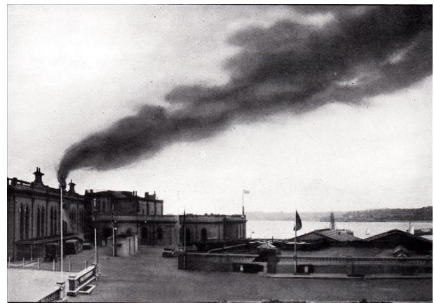
The old generating station at Beacon Quay, now superseded by Newton Abbot Station. This view shows the roof of the engine room buildings on the right. The boiler house was situated in cellars below the Medical Baths on the left.

I wonder if the borough electrical engineer could put into the new station at Newton Abbot as a permanent exhibit one of the original rectifiers, and by some means have it running (behind protective triplex glass !), just as we used to run it on load in those dear old days. But probably the machines fetched much more than they cost when new, as scrap metal!