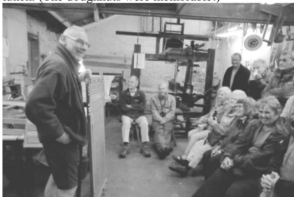
Group of Members at the Gig Mill