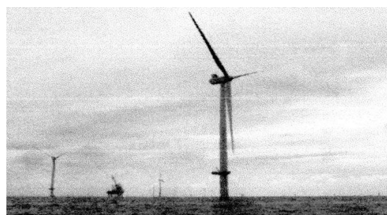
Nachell and Blades installed

Connection of the turbines to the off-shore substation is via 140km of 3 core plus fibre optic 33kV sub-sea array cables. There are 12 strings of cables laid with some 8 to 10 turbines per string. These cables are embedded 1m deep into the seabed using a jet or plough technique. Installed in September 2016, by the vessel Furgo Saltire, the off-shore substation is unmanned, remotely operated, housing all the 150kV and 33kV GIS switchgear; and two 33/150kV transformers to export the power via two 150kV undersea and underground cables to the National Grid Bolney 400/132 kV substation in Twineham village, located near to Burgess Hill.