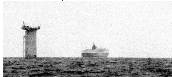
Base for Nachell installed

To install the turbine masts, nacelles and blades, jack up vessels are used. These are: MPI Discovery, MPI Adventure and Pacific Osprey, they can work in sea depths of up to 50m. Each vessel carries up to 8 turbine masts and associated nacelles and turbine blades. It takes some 24 hours to install one complete wind turbine. When complete the field has a capability of generating 400MW from 116 - 3.45MW Vestas turbines on monopole foundations.